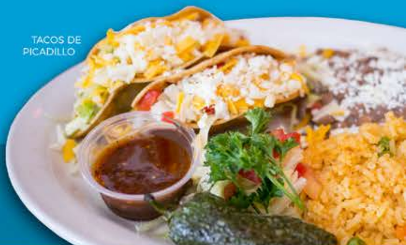
TACOS DE PICADILLO

SAUTÉED BELL PEPPERS, ONIONS, TOMATO, SQUASH, & BOILED PINTO BEANS, TOPPED WITH SLICED AVOCADO