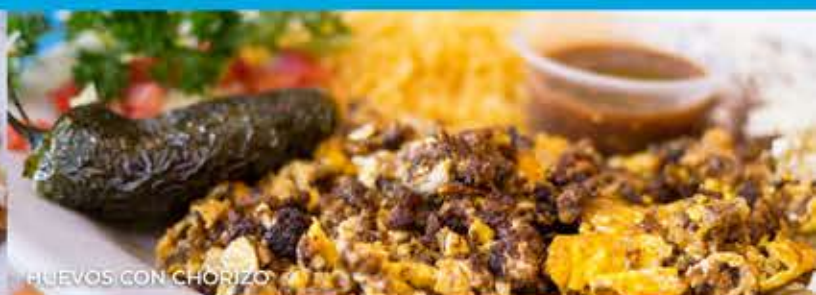
HUEVOS CON CHORIZO